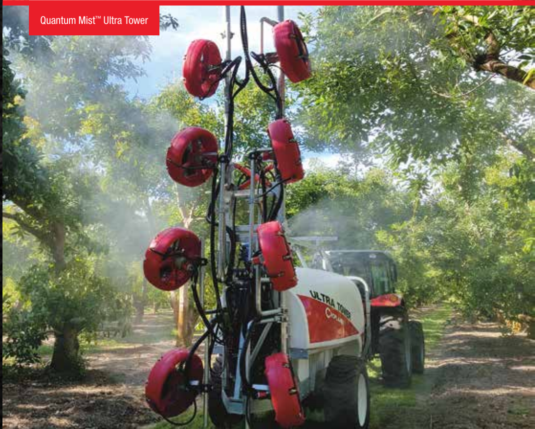
Quantum Mist™ Ultra Tower

Prices and specifications subject to change without notice. Photos are for illustrative purposes only.