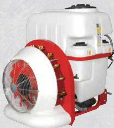
300 litre Cropair with 500mm fan