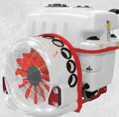
600 litre Cropair with 800mm fan