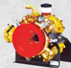
Heavy duty brass 170 pump standard