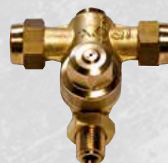
Brass roll over nozzle bodies standard on both fans