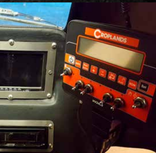
Inside cabin of Self Propelled Cropliner 2000

With four wheel steer the tight turning capability of the Self Propelled Cropliner means that properties with narrow headlands are no challenge, and you will increase your spraying efficiency by quickly getting into the next row.