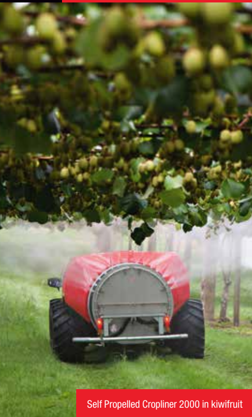
Self Propelled Cropliner 2000 in kiwifruit