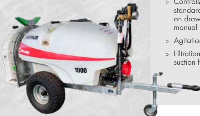
1000 litre Cropair with 800mm fan