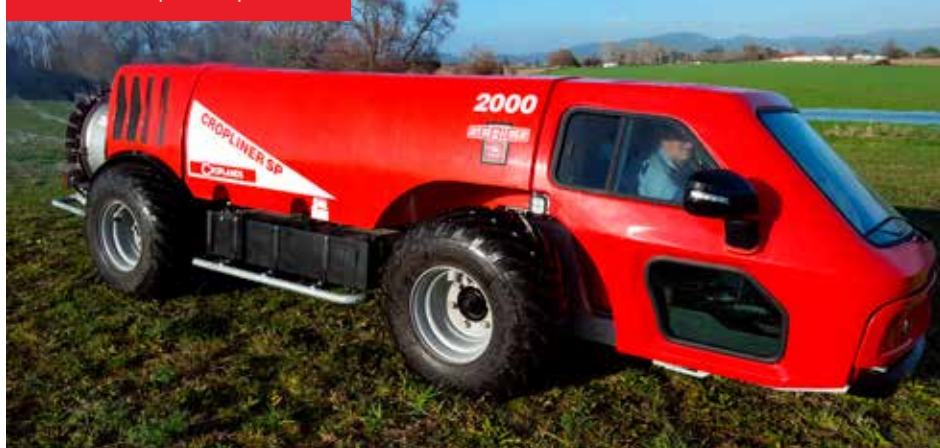
Series 2 Self Propelled Cropliner 2000

Prices and specifications subject to change without notice. Photos are for illustrative purposes only.