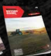
WEEDit Optical Spot Spraying