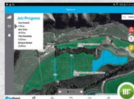
NuPoint app in action