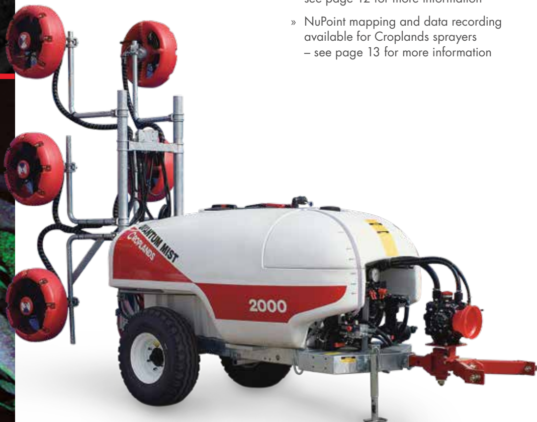
2000 litre Quantum Mist™ XL series sprayer with 3 fans per side, standard self-steering drawbar, single axle and 180 L/min diaphragm pump.