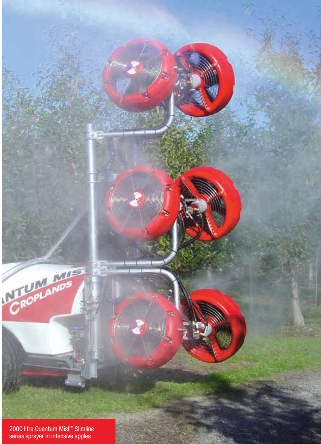
2000 litre Quantum Mist™ Slimline series sprayer in intensive apples