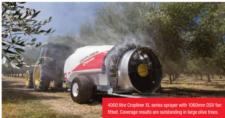
4000 litre Cropliner XL series sprayer with 1060mm DSV fan fitted. Coverage results are outstanding in large olive trees.